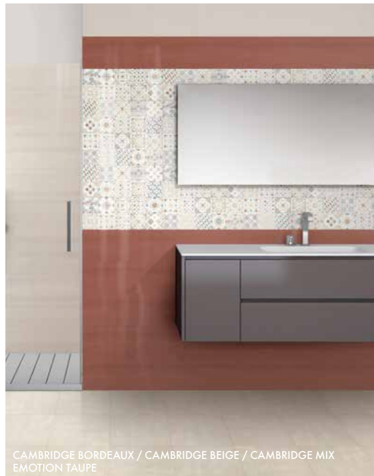
CAMBRIDGE BORDEAUX / CAMBRIDGE BEIGE / CAMBRIDGE MIX EMOTION TAUPE