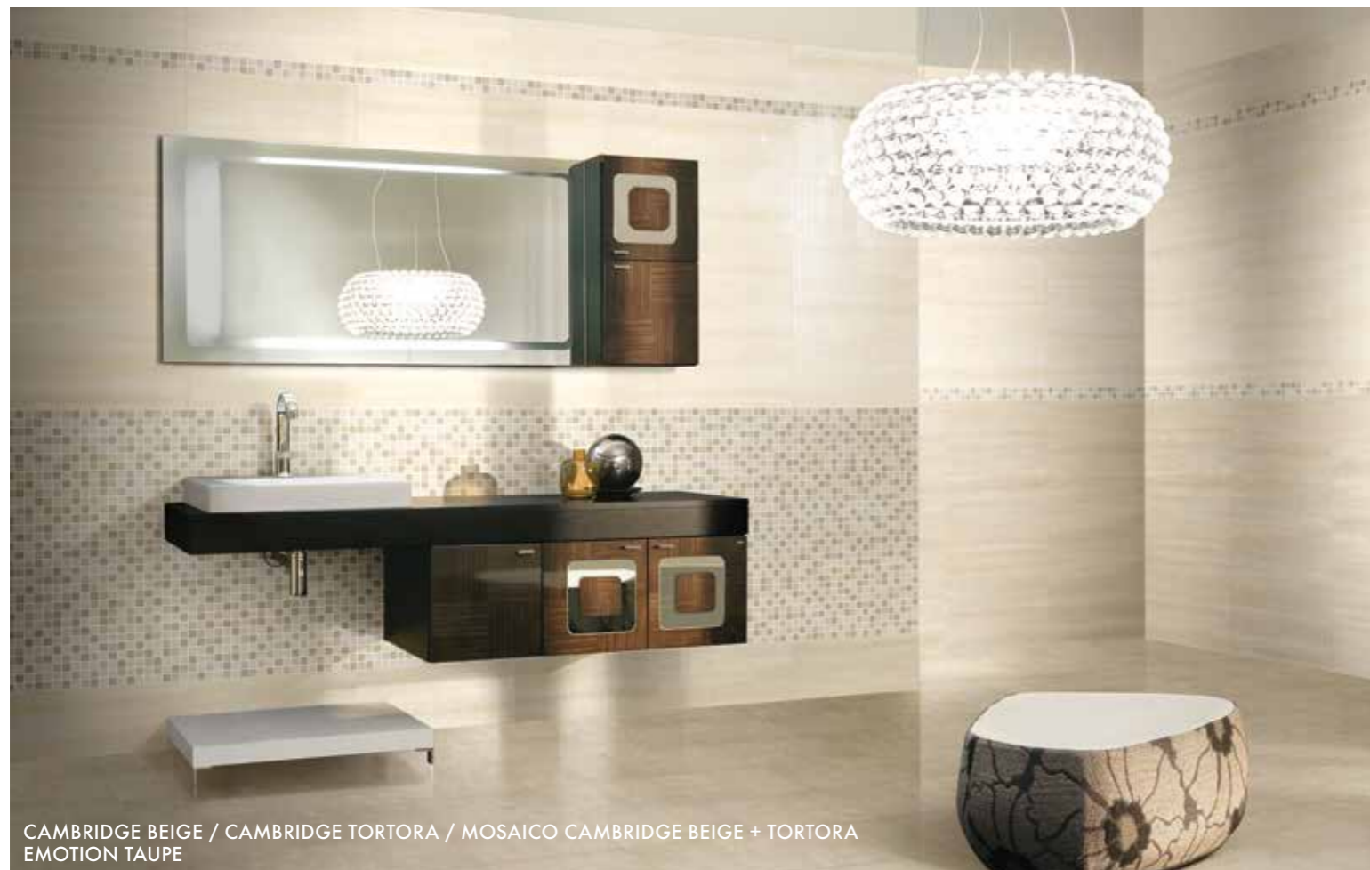
CAMBRIDGE BEIGE / CAMBRIDGE TORTORA / MOSAICO CAMBRIDGE BEIGE + TORTORA EMOTION TAUPE